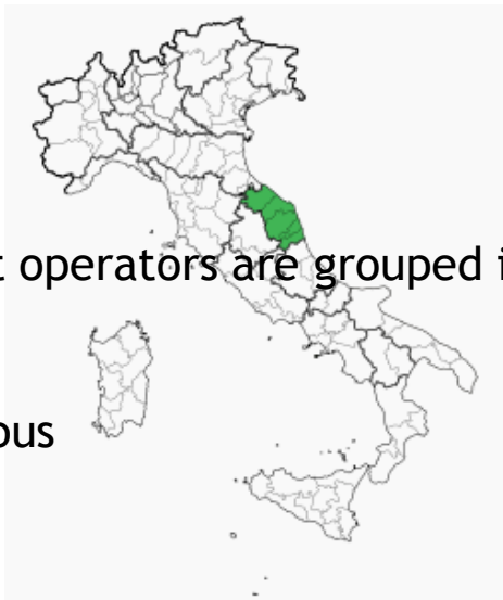
Schema Riallineamento dati XML e topologia Basi dati Presso Regione Marche

The data related to transport service are collected in a single database managed and updated by Pluservice (contracted by the Marche Regional Authority)